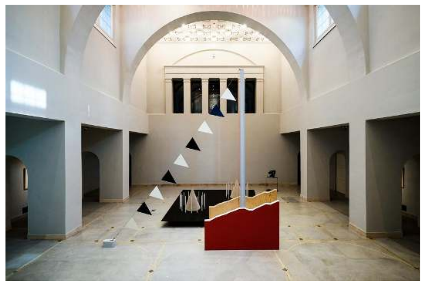
Nairy Baghramian, The Iron Table (Homage to Jane Bowles) , 2002, various materials, installation view, Hessisches Landesmuseum, Kassel, documenta 14, photograph: Michael Nast